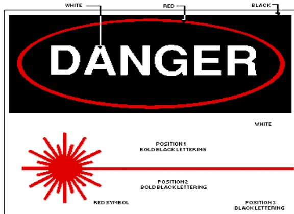
Figure 2, Temporary Signage for Maintenance of Embedded Lasers