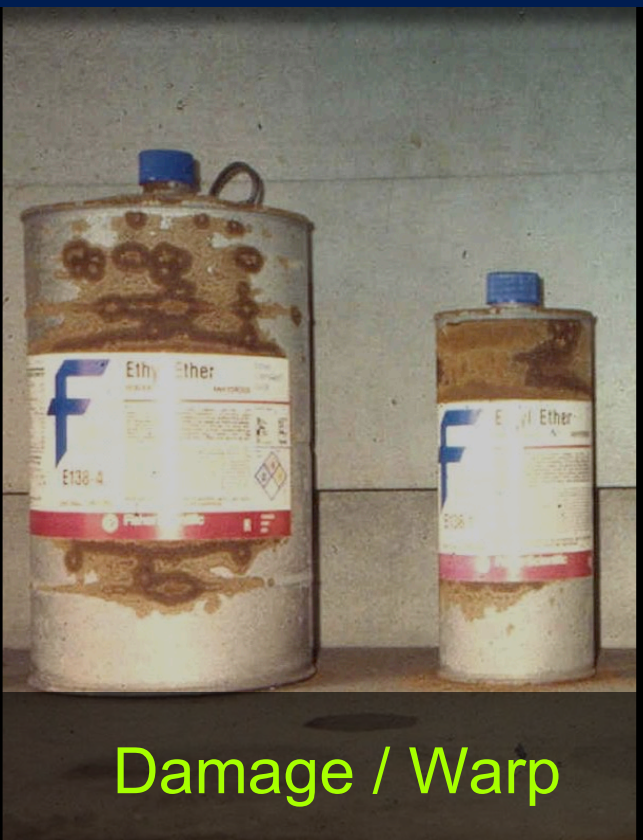
Damage / Warp

RECLAIM SPACE, REDUCE EXPOSURE, AVOID INCIDENTS & SPILLS