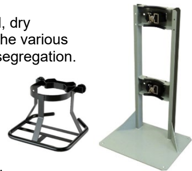
Figure 5. Examples of Floor Stands