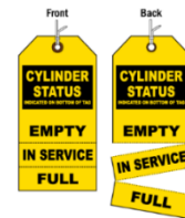
Figure 2. Example of a Cylinder Status Tag