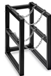
Figure 6. Example of a Floor Rack