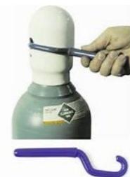
Figure 3. Example of Valve Protection Cap Wrench