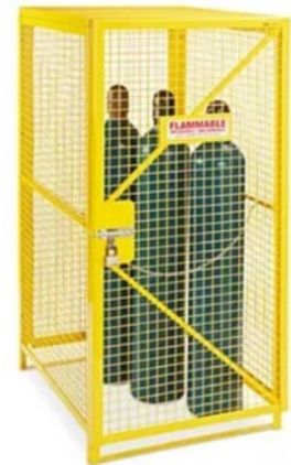
Figure 4. Example of Vertical Cylinder Cage