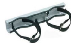
Figure 7. Example of Wall Mount Cylinder Bracket