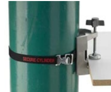
Figure 8. Example of Workbench or Table Cylinder Bracket